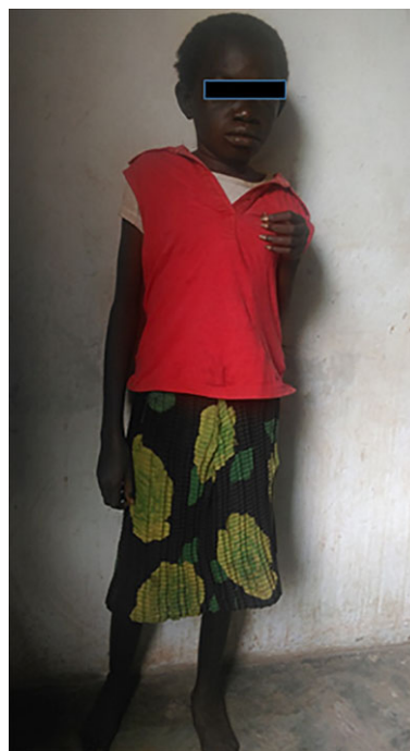
Figure 2. Woman, with Nakalanga syndrome, 26 years old, from an onchocerciasis-endemic region in the Democratic Republic of the Congo.

The Nakalanga syndrome is another clinical condition observed in onchocerciasis-endemic regions that is associated with epilepsy. The Nakalanga syndrome was first described in 1966 among a population who migrated to the Mabira Forest, Buikwe District, in the central region of Uganda, which was at that time an onchocerciasis-endemic region. 46,47 The Nakalanga syndrome is characterized by severe stunting and absence or delayed development of external signs of sexual development. 17,46 Nakalanga features have been described in several other onchocerciasis-endemic regions. 21,48,49 During epilepsy prevalence surveys performed between 2014 and 2016, in the DRC several persons with stunted growth, absence of external signs of sexual development, cognitive impairment, and epilepsy were observed in onchocerciasis-endemic areas in the Bas Uélé, Tshopo, and Ituri Provinces. For example, a pronounced form of Nakalanga was observed in a 26-year-old woman in Tshopo Province. She had the appearance of a child (weight 26 kg, height 1.27 m), without any external signs of sexual development. She had developed tonic-clonic seizures at the age of 16, was cognitively impaired, and had only reached third grade of primary school. A Skin snips taken from the left and right italic crests showed the presence of microfilariae (parasite densities of 10 and 33 microfilariae/mg skin, respectively; Fig. 2).