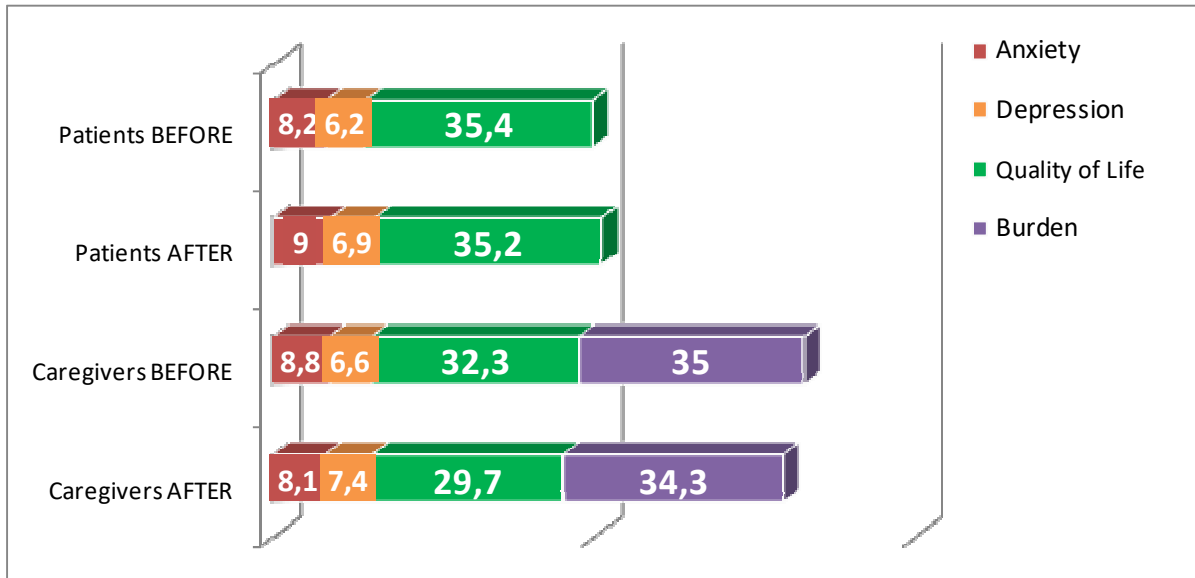
Figure 3: Quantitative evaluation before and after TPE