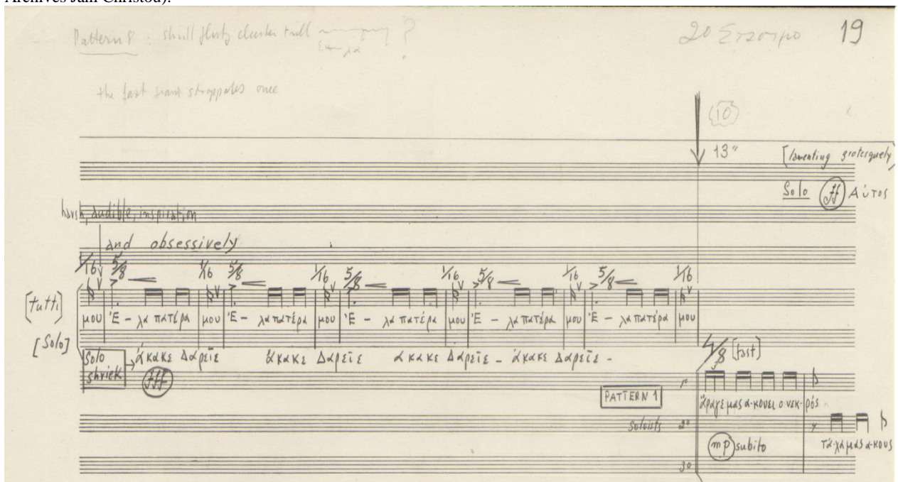
Figure 10: Jani Christou, The Persians , second stasimon , Darius' spirit invocation (manuscript score, with permission of Sandra Christou, Archives Jani Christou).