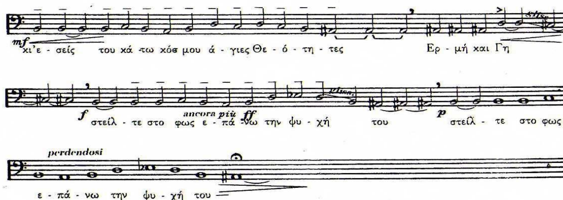
Figure 6: Jani Christou, The Persians , second stasimon , invocation of Darius's spirit (reproduced from the handwritten score, with permission of Sandra Christou, Archives Jani Christou).

by Byzantine chant 55 , especially the pedals ( isson ), the chromaticism of melodic lines, the use of tetrachords and their limited range (see Figure 6).