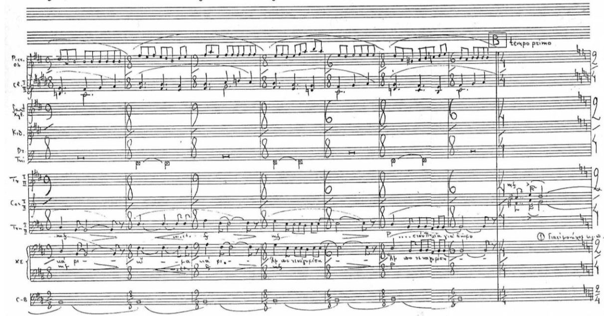
Figure 2: Georges Couroupou, Rhesus , first stasimon, part A (copy of the manuscript score, with permission of the composer).

by Alexis Minotis, Mikis Theodorakis 26 wrote complex serial instrumental parts. They alternated with monophonic choral chants, based mainly on diatonic tetrachords, pedals or isson 27 , and Greek rhythms in 9/8 meter (See Figure 3). Finally, the Dimitris Dragatakis 28 score for Antigone by Sophocles, performed by the National Theatre of Greece in 1969 and staged by Lambros Costopoulos, evoked the traditional music of Epirus. Modal melodic lines, augmented intervals and chromatic tetrachords were perfectly assimilated to the composer's personal atonal language 29 (See Figure 4).