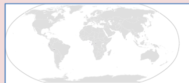
Countries involved in KAP LMICs

Ethical committees in France and in each partner country approved the KAP study.